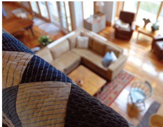
BELOW: This heirloom quilt hangs on the railing overlooking the great room below.

its time. The overall ambience of the home is restful relaxation – a true getaway from the hustle and bustle of an urban setting.