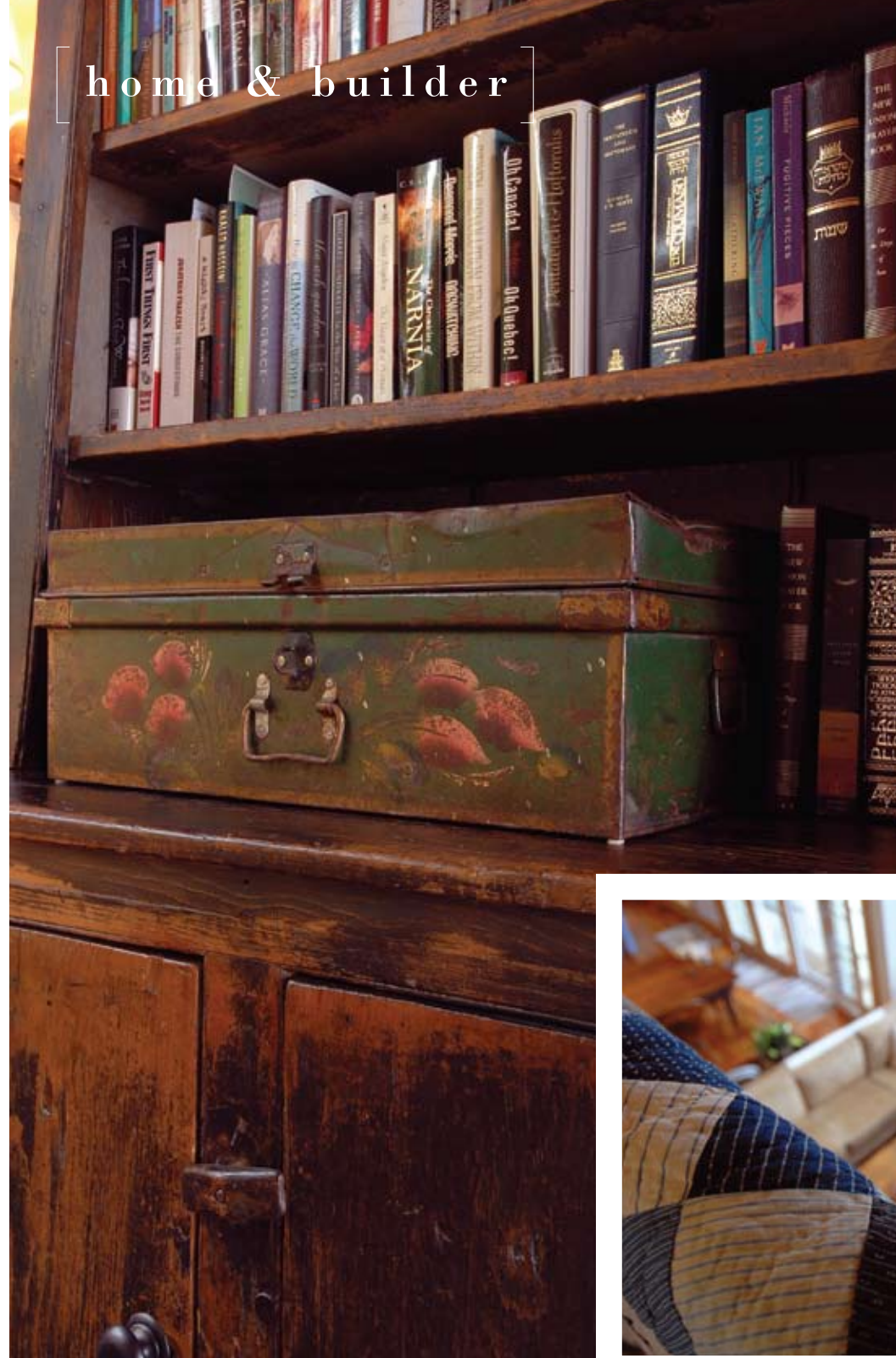
LEFT: An office on the landing upstairs features this old Canadiana bookcase.