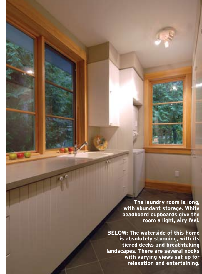
The laundry room is long, with abundant storage. White beadboard cupboards give the room a light, airy feel.

Zoom out. As you leave this cosy home, built with care down a secluded lane, through a shadowy cedar forest, you're struck by the home's appropriate sense of scale. You feel this timeless home is already an integral part of its natural surroundings – a warm refuge for its owners that easily withstands the wild winds off Georgian Bay. OH