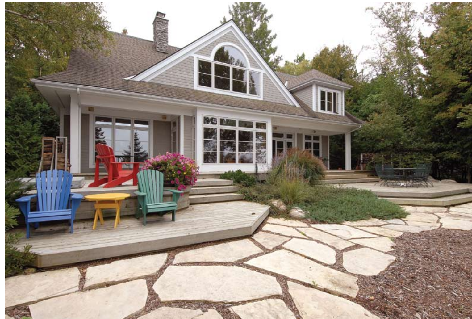
BELOW: The waterside of this home is absolutely stunning, with its tiered decks and breathtaking landscapes. There are several nooks with varying views set up for relaxation and entertaining.